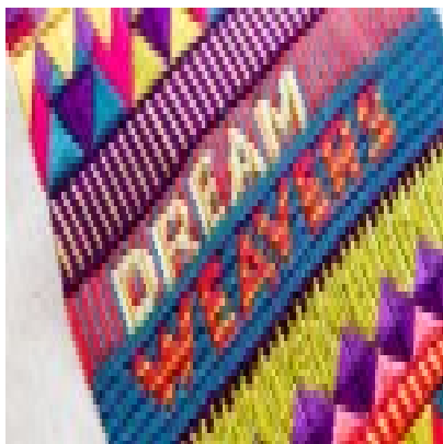
Artisan Embroidery: MaricorMaricar